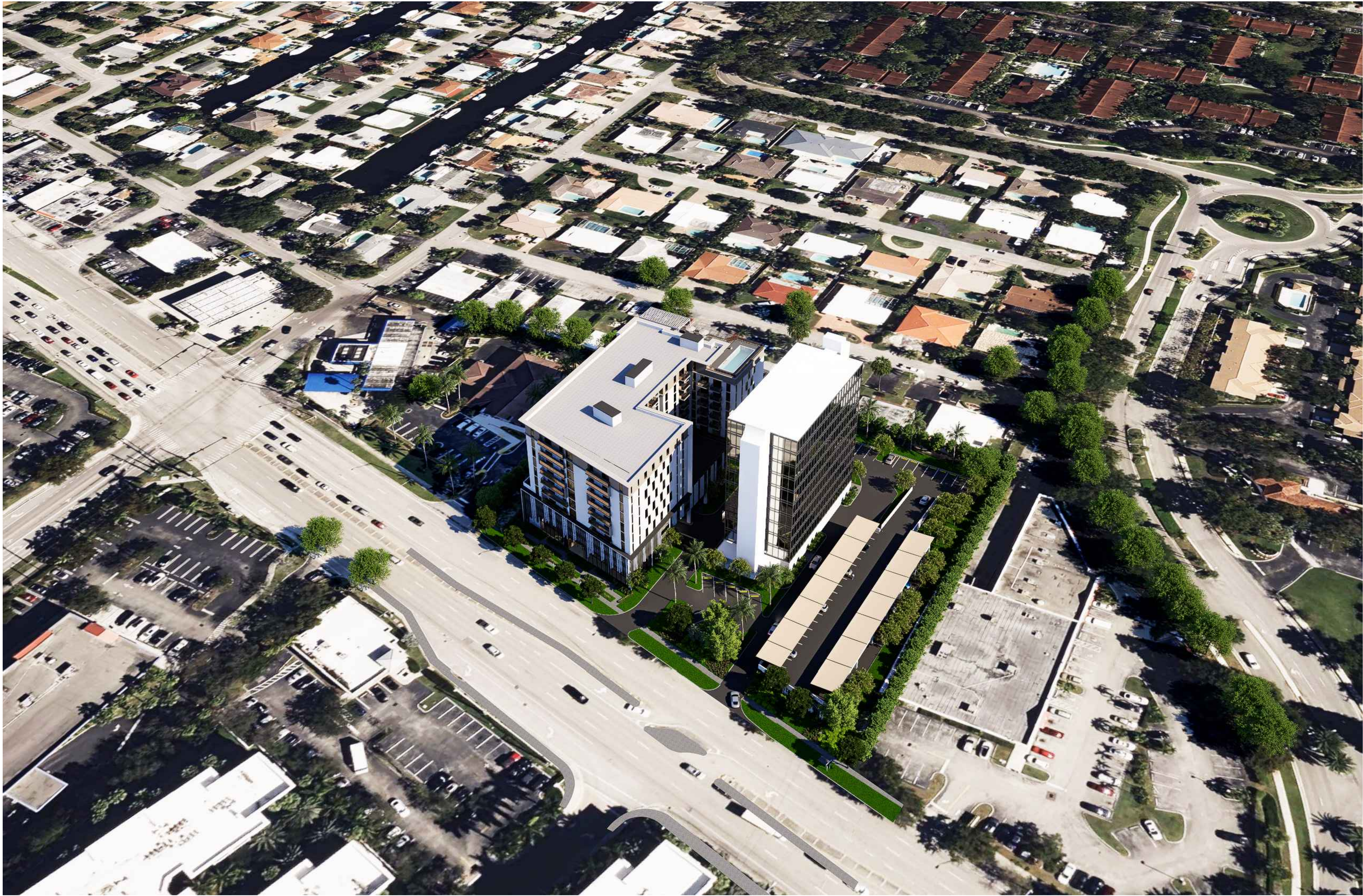
AREA VIEW LOOKING NORTH EAST